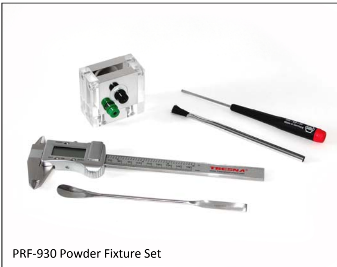
PRF-930 Powder Fixture Set