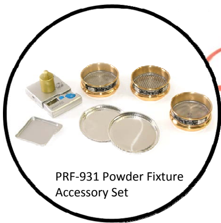
PRF-931 Powder Fixture Accessory Set

For measurement of powders and granulated materials.