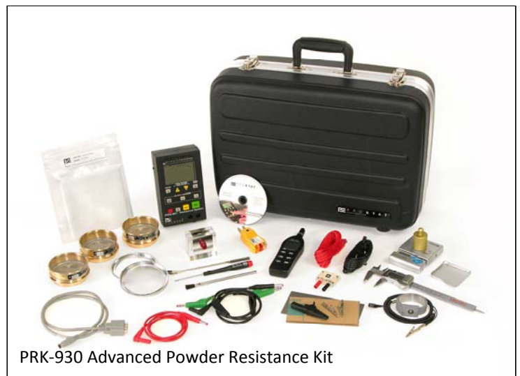
PRK-930 Advanced Powder Resistance Kit

Powder solids with high resistance can develop a static potential.