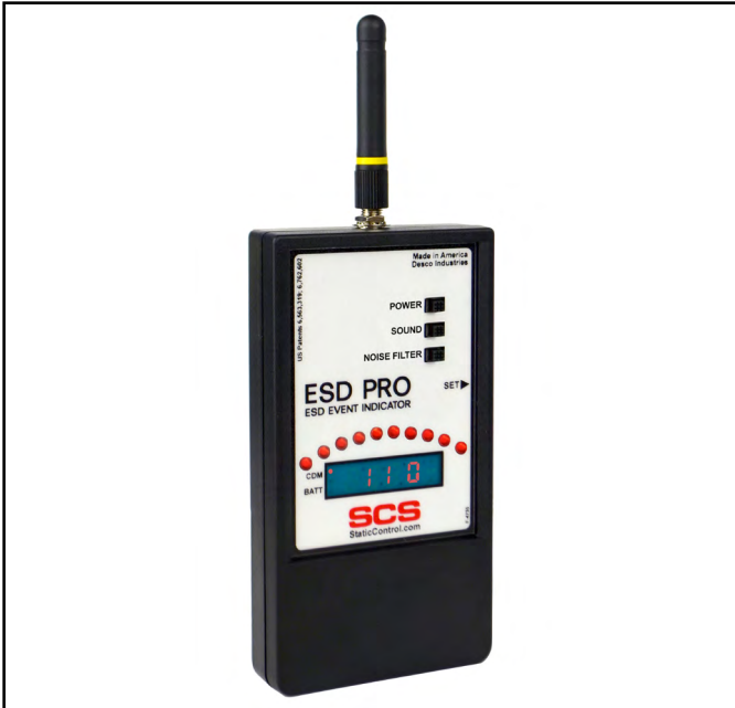
Figure 1. SCS CTM082 ESD Pro - ESD Event Indicator