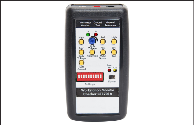
Figure 3. SCS CTE701 Workstation Monitor Checker

The checker verifies the proper operation of dual wrist strap monitoring. Connect a 3.5 mm test cable to both the checker and to the operator jack of the monitor. At this point the monitor should indicate failure. Depress the Pass button on the wrist strap section. The monitor should indicate a good connection. While pressing the Pass button, press body voltage “high.” At this point the Wrist Strap LED would be blinking red.