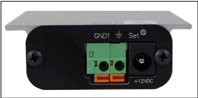
Figure 2. Rear view of Wrist Strap and Ground Monitor

Attach 18 AWG wires to the unit as described below. Strip back the vinyl insulation at each end of the wires to approximately 1/3 inch (8 mm). Twist the stranded wire on each end before inserting the wire into each connector location. In order to attach the wire, insert a small blade screwdriver into the orange slot above. Gently push inward and insert the stripped wire fully into the hole in the green connector. Hold the wire fully in and release the screwdriver to allow the wire to catch. Attach the green monitor ground cord to the ground connector on back of unit. Attach the impedance monitor wire to the "GND1" connector on the back of the unit.