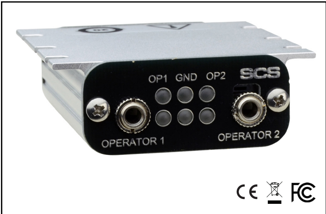
Figure 1. SCS CTC337 Wrist Strap and Ground Monitor