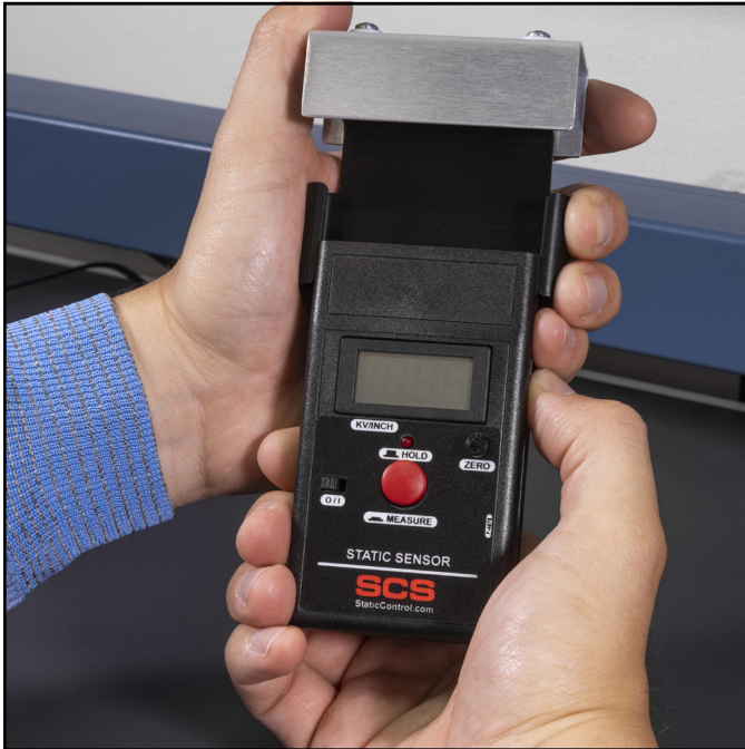
Figure 8. Sliding the Conductive Plate onto the Static Sensor