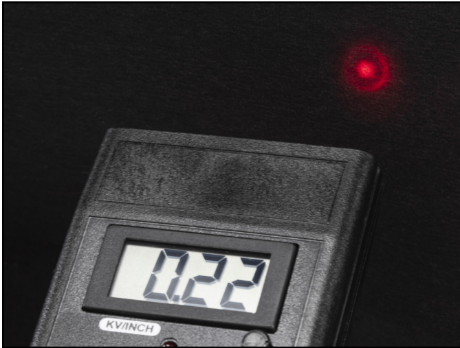
Figure 7. Aligning the two bullseyes emitted by the LED range indicator