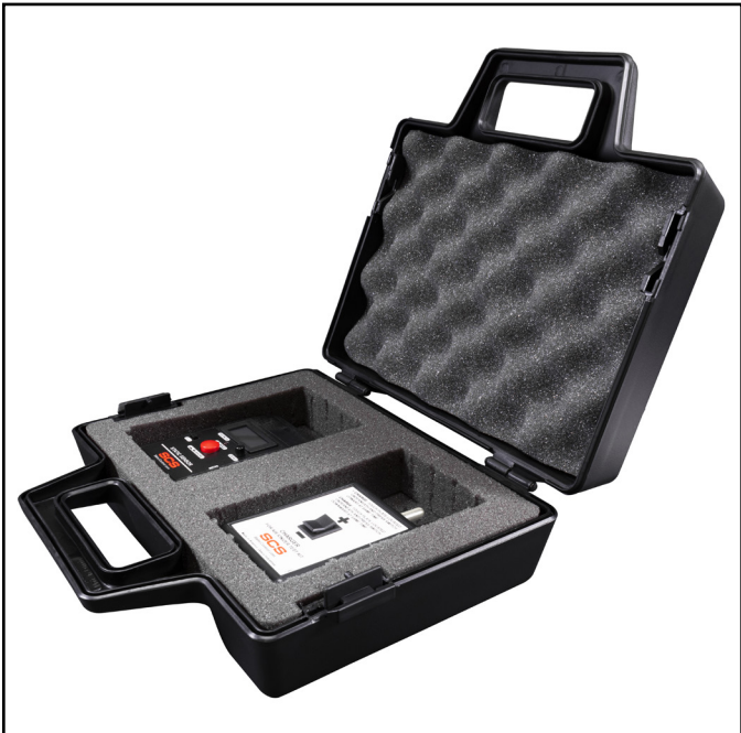
Figure 3. Air Ionizer Test Kit and Carrying Case