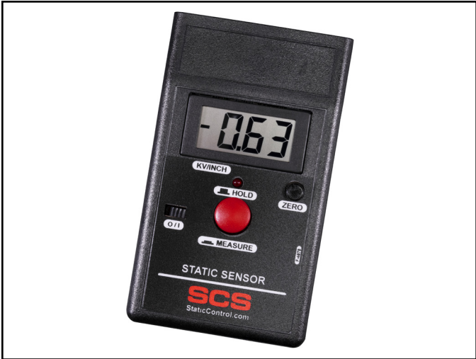
Figure 1. SCS 770716 Static Sensor