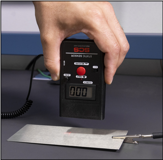
Figure 6. Pointing the Static Sensor to a grounded surface

Slide the power switch to the right to power the Static Sensor. Point the top of the Static Sensor approximately 1 inch (2.5 cm) away from a grounded metal surface. Proper spacing is indicated when the two red bullseyes emitted LED range indicator become centered on top of each other. Turn the rotary zero knob until the Static Sensor's display reads 0.00.