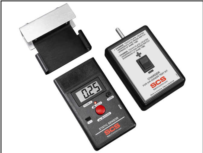
Figure 2. SCS 770717 Air Ionizer Test Kit