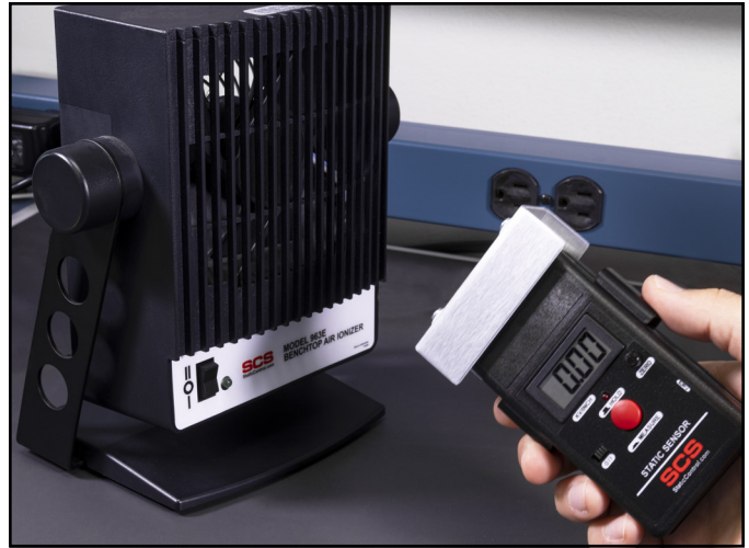
Figure 9. Using the Static Sensor with Conductive Plate to measure the offset voltage of a benchtop ionizer

NOTE: When testing pulsed ionizer systems, the voltage displayed is constantly changing. This pulse rate may be faster than the display update rate of the Static Sensor, therefore the displayed voltage is an average of the actual voltage. The output of the Static Sensor is useful in this situation for more accurate measurements.