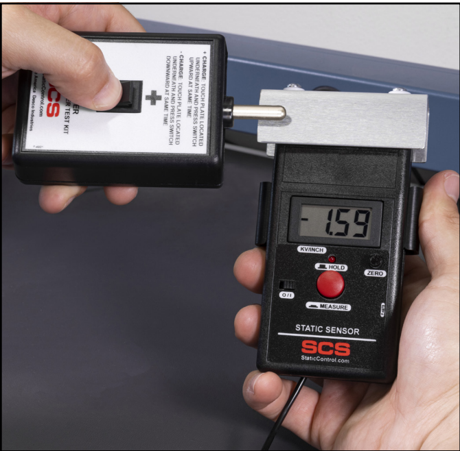
Figure 10. Using the Charger to apply a charge onto the Conductive Plate

NOTE: A ground path must be provided between the touch plate of the Charger and the ground reference of the Static Sensor. This is normally provided by holding the Charger in one hand and the Static Sensor with Conductive Plate in the other.