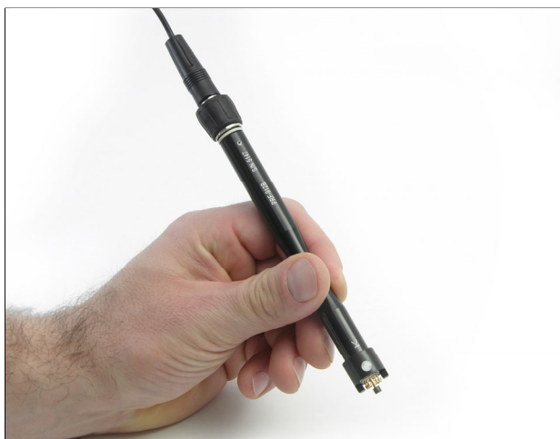
Figure 8. PRF-900 STOP on the PRF-912B.

The PRF-900 STOP fits snugly on the fixture's housing, surrounding the concentric ring pin assembly ( Figure 8 ). This assists the user in obtaining repeatable measurements using consistent electrode pressure ( Figure 9 ).