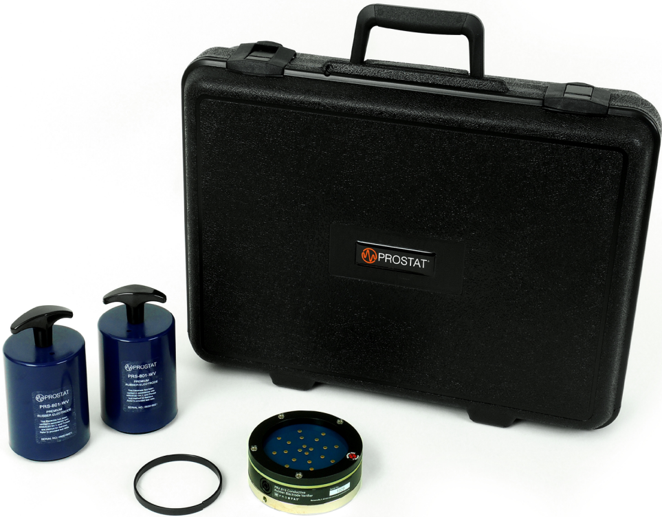
PRV-815 Premium Electrode Qualification Kit