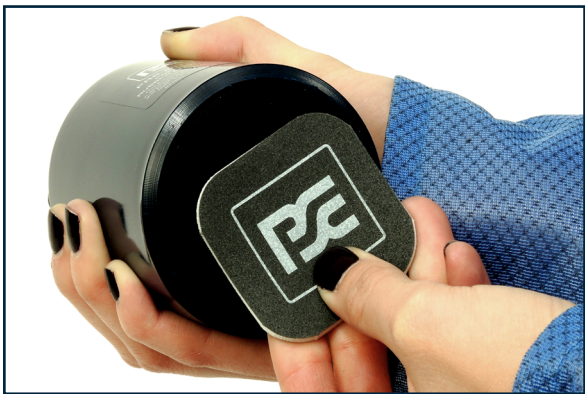
A light dressing pad is provided to allow dressing Premium Electrode when needed.