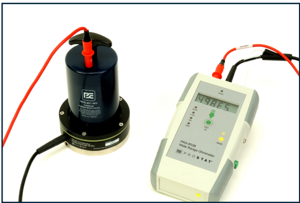
Optional: PAS-853B Wide Range Ohmmeter